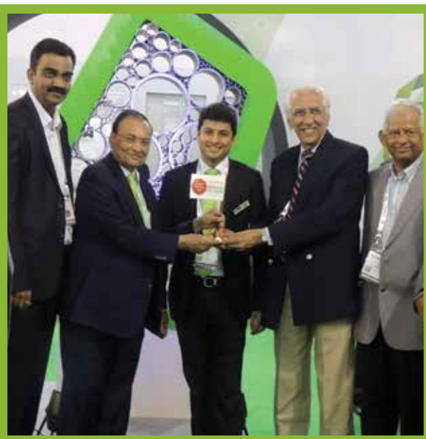
Company's Stall at Plastindia Exhibition, 2015 held at Gandhinagar, Gujarat in February, 2015 attracted every visitor and won the Best Exhibitor Stall Award.