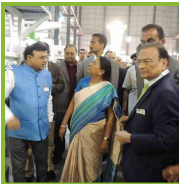
Smt. Anandiben Patel, Hon'ble Chief Minister of Gujarat seen visiting the Company's Stall at PlastIndia 2015